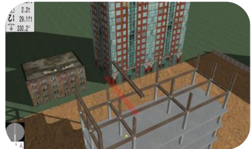
Positioning girders at target positions as part of steel erection