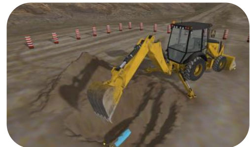
Exposing a buried utility with the backhoe bucket