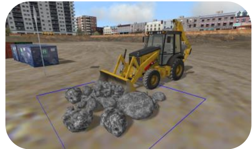
Dumping material on dumping zone with loader bucket